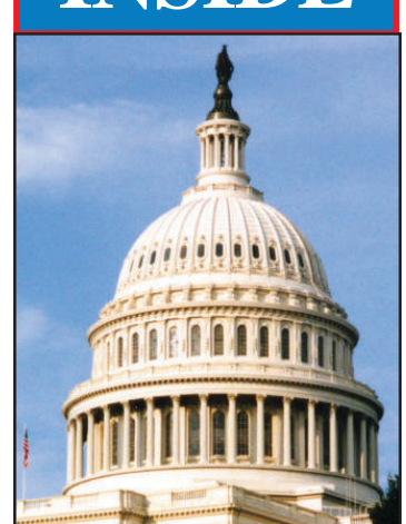
Heritage Day / A3