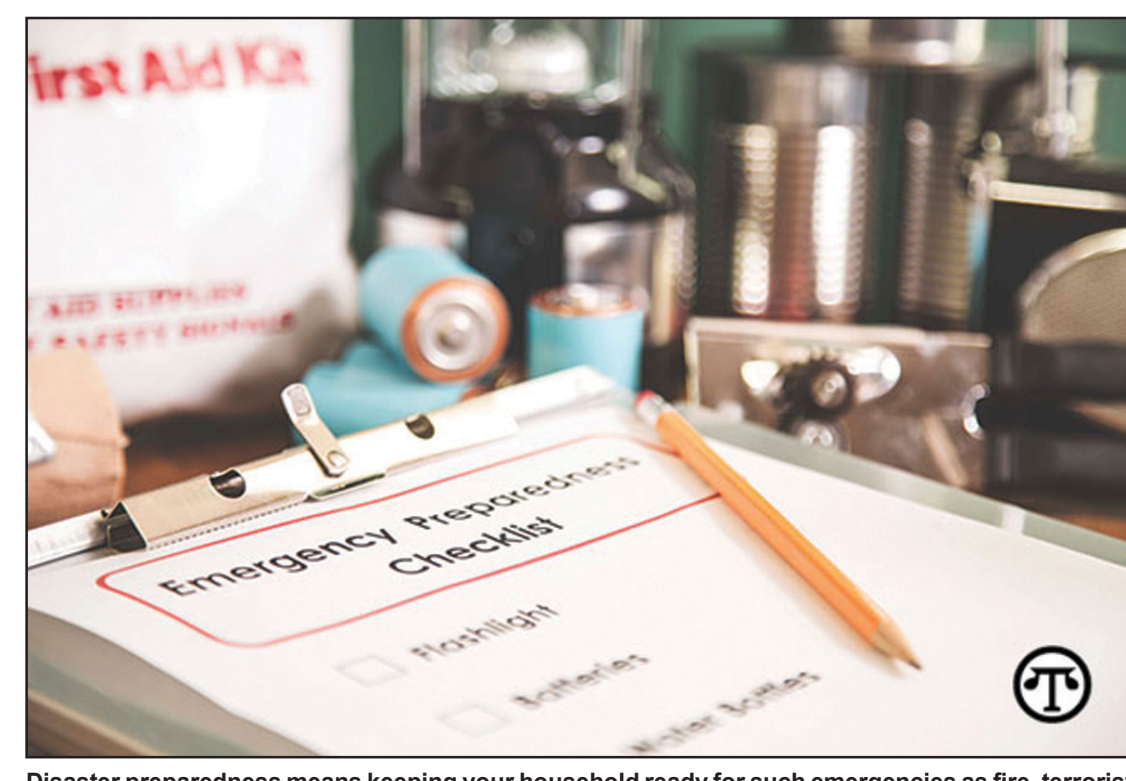
Disaster preparedness means keeping your household ready for such emergencies as fire, terrorist attack, earthquake, tornado, hurricane, flood, storms or drought.

In 2019 alone, there have been at least six weather and climate disaster events with losses exceeding $1 billion each—but you can be prepared for anything with the expert assistance of a NAPO Professional Member.