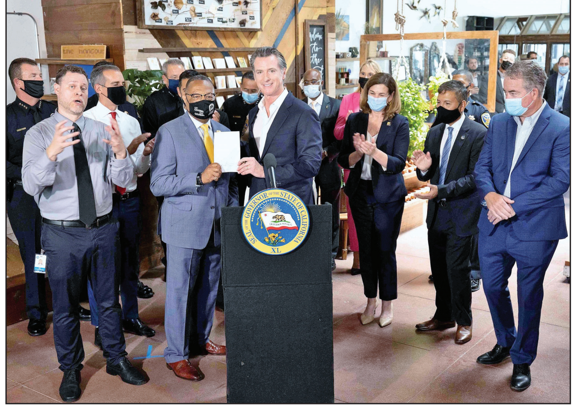
Governor Newsom signs legislation targeting retail theft alongside law enforcement leaders, legislators and Big 13 mayors. (File Photo July 21, 2021)

"The CHP remains steadfast in its efforts to help reduce orga-