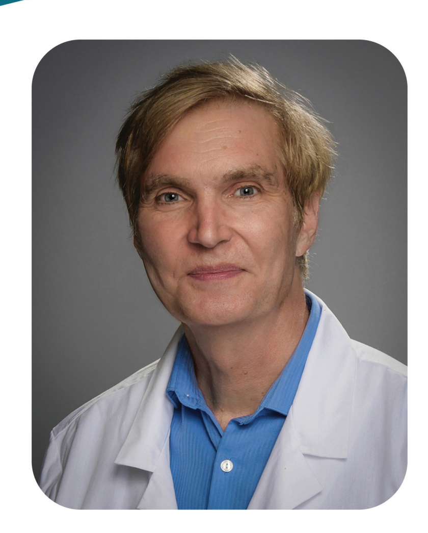
"I believe in doing medicine the old-school way."