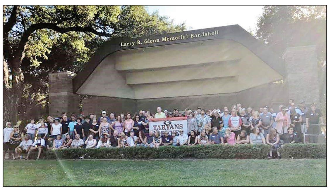
A group photo from a previous Glendora All Class Reunion held at Finkbiner Park.

GLENDORA - Glendora is one of the few cities that annually holds an ALL CLASS RE-UNION. This year their annual event is October 9th, 2021 in Finkbiner Park near the bandstand. It's an all-day Picnic from 10:30 to 4:30. Anyone who at-